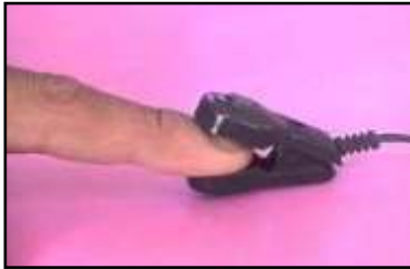
Finger Clip application