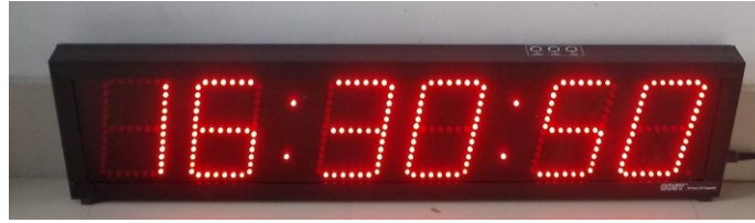
New Model With Display Freeze Function.